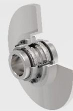
Type S DFC

For any QUERY or request for QUOTATION :