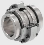
Type S & SR