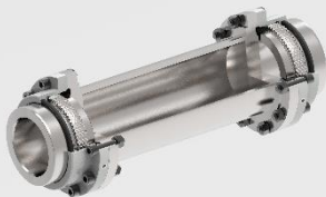
Type S E