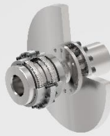
Type S DF