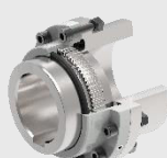
Type S PA